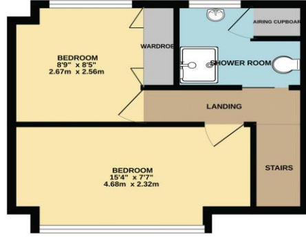
1ST FLOOR 293 sq.ft. (27.2 sq.m.) approx.