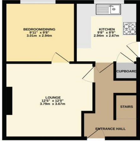
GROUND FLOOR 400 sq.ft. (37.2 sq.m.) approx.